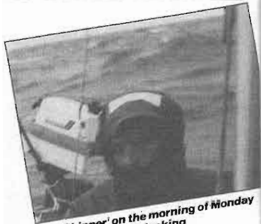
'The Skipper' on the morning of Monday 25th August 1986, looking tired and worried.

Midnight saw the barometer bottom out at 1002. Wind force was 9 to 10 and veering